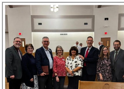
October Marriage weekend in Fort Worth