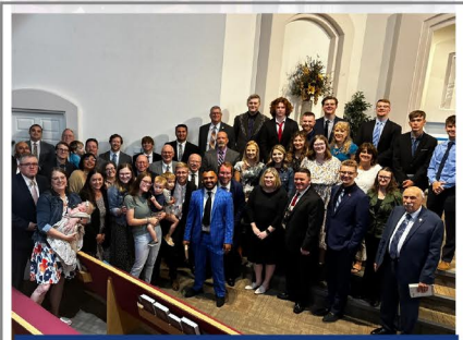
August First chapel at BV for 2024/25