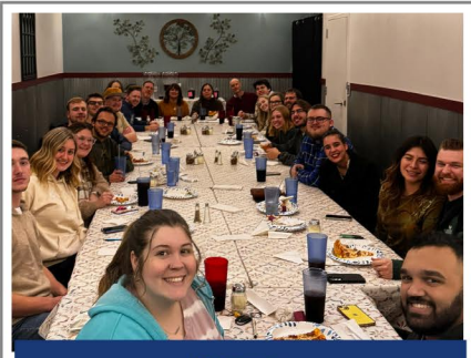
February A marriage enrichment weekend for the Bear Valley students