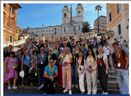
May A wonderful PTP / BP tour in Italy and Greece