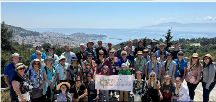
We were blessed to teach and guide over 90 participants on educational journeys through the Bible lands.

New "Connections" videos have been released. One is about the Temple, and another about the historical context of Paul's speech and work in Athens. Also, many "Image Insights" have been shared.