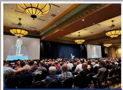
July Inaugural PTP Branson, MO