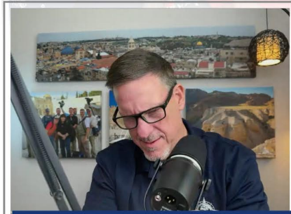
September Bible Passages Podcast begins recording