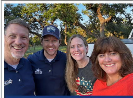
June The Ketchems came to work on BP projects