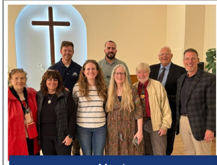
March Blessed to worship with the church in Athens while on tour with BVBI in Turkey/Greece