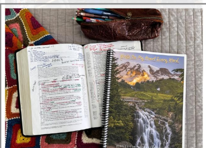
November Scripture Writing for 2025 is ready!