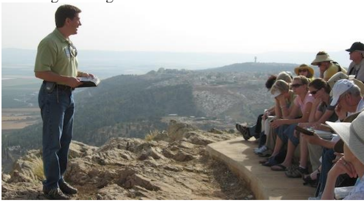
(Photo: Studying the life of Christ, overlooking the Jezreel Valley)

Don't Forget the Basics. Hopefully, you've thought of these. But just in case: