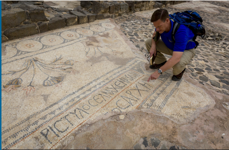
Exploring the Agora at Scythopolis (cf. Acts 17:17-18)

God has charged evangelists, shepherds, and teachers with the responsibility of equipping the saints for the work of ministry for the building up the body of Christ (Eph. 4:11-12). Building and equipping is what congregations must learn to do well; the growth and strength of the church is dependent upon it. The key to growth is to engage more people in the work of ministry. This is done by doing four things: (1) investing deeply in the lives of people through discipling and mentoring; (2) developing leaders; (3) feeding members with the word of God; and (4) equipping them with the tools they need for Bible study and for personal growth and development. Bible Passages is dedicated to all four of these components. While much of our work centers upon items 2 and 4 mentioned above, we also conduct marriage retreats, coping seminars, evangelism classes, and counseling courses for elders and preachers.