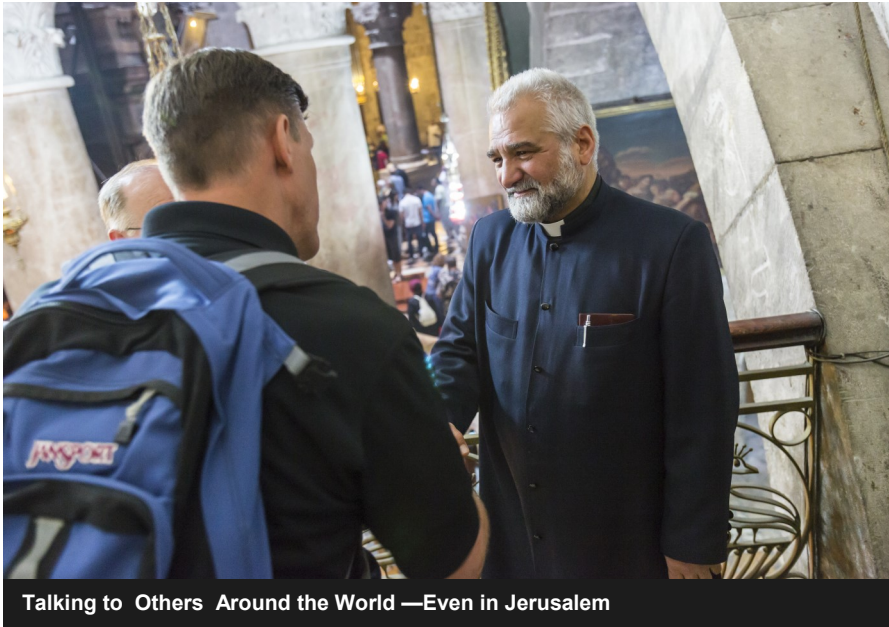
Talking to Others Around the World —Even in Jerusalem