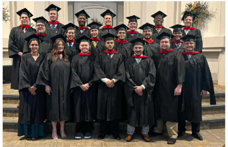
Bible Passages and Polishing the Pulpit Expedition 2024

On one of our most recent trips to the Bible lands, we passed near Pella, Greece, the birthplace of Alexander the Great. Throughout our journey we also encountered numerous statues and iconography memorializing this great hero of the ancient Greeks. Born in 356 B.C., his conquest in the continents of Europe and Asia resulted in one of the largest empires in ancient history. His legacy with the spread of Greek culture (e.g. a common language, democracy, rhetoric, and philosophy) along with the influences of the later Roman empire were major factors enabling the advancement of the gospel in the first century after Christ. Alexander's reign was extremely short, and after his death, his kingdom was divided among his generals into four separate lesser domains. Did you know that the book of Daniel, some 250 years earlier, foretold of these exact events?